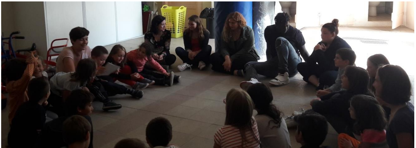
An Afternoon at Ambialet's Primary School