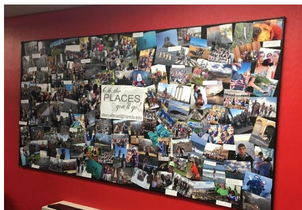
Check out the new study abroad photo display in the Library, "Oh the Places You'll Go."

SFU students recognize these benefits and lead the pack in study abroad. The Open Doors Report includes the national percentage of college students who study abroad before graduating is 10%. The percentage of SFU students who have studied abroad before graduating is 31.6%!