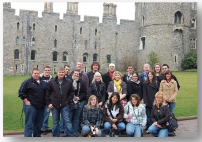
Above: SFU Business Administration Spring Break in London group.