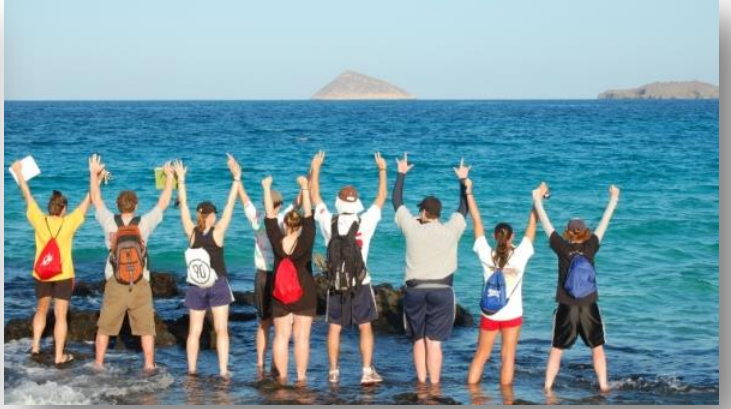
REACH HIGHER. GO FAR. GO INTERNATIONAL.

Above, left: Students in front of the Louvre during the Spring Break in Paris trip. Above, right: Students at the Galapagos Islands during Spring