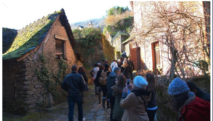
Walking through the medieval village of Conques

In addition to the museum, a number of our company visited the Rodez Cathedral which was built in the early 16 th century. The cathedral played a role in the definition of the meter since it was used as a central point in the attempt to calculate the circumference of the earth in the 1790s.