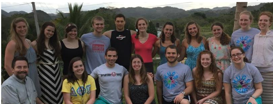
HUGS group in Jamaica