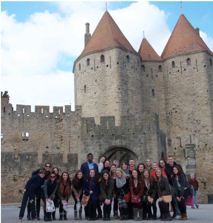
Students visiting the fortified city of Carcassonne

On Thursday we had our second excursion to Toulouse where we visited the 13 th century Church of les Jacobins, which had been the mother church of the Dominican Order. This church contains the tomb of St. Thomas Aquinas. In the afternoon we visited the Departmental Museum of the Resistance and Deportation, which was about the French Resistance (as well as the lack thereof in various quarters).