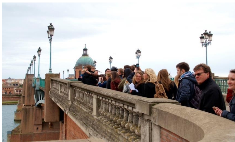
Bridge Saint-Pierre over the Garonne River

Crêpes made two appearances on the menu this week since the holiday of Candlemas (Feb 2 nd ), known in France as "la Chandeleur Fête de la Lumière," was this week. Candlemas is traditionally celebrated in France by eating crepes and drinking cider.