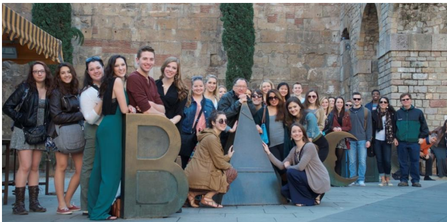
Gothic Quarter of Barcelona

Park Guell, a park designed by Antoni Gaudi (who also was the architect for the Sagrada Familia and Casa Batllo) is a UNESCO World Heritage Site. The Park also contains a house that was designed, and lived in, by Gaudi. This house is now a museum.