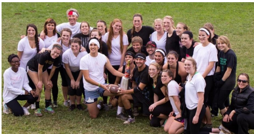
After hosting a Thanksgiving meal for 65, our group shares with the village the American tradition of the post-meal football game.