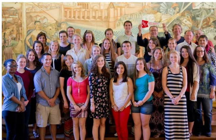
Fall group visiting with the Deputy Mayor of Albi (in back holding the SFU banner).

Beyond the travel and studies, we formed relationships. We bonded with the small village of Ambialet and its people, joining the community for lunch at the local cafe, conversations in their homes, and celebrations in the local gathering hall. We witnessed disaster as the Tarn River flooded, and helped the community to clean and begin the road to recovery. We bonded with the delegation from Fort Mont Valerian, who remembers the French Resistance to the Nazi occupation during World War II. We bonded with the dogs of Le Prieure: Shaq, Bobo, Jay-Z, and Nemo. We also bonded with one another. Although students came from Saint Francis University in Pennsylvania, and Curry College in Massachusetts, the entire group of students, faculty, and the families of the faculty quickly became one large, extended family. Study abroad in France has become a defining experience in all of our lives, and will continue to affect each of us throughout the years to come.