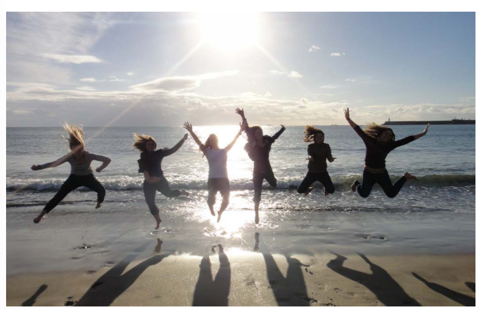
Some of the Semester in France students while visiting Portugal

Although the job market might be slowly improving, it is more important than ever to stand out from other applicants however possible. Research shows that studying abroad gives students additional qualifications that can improve their chances of landing a position.