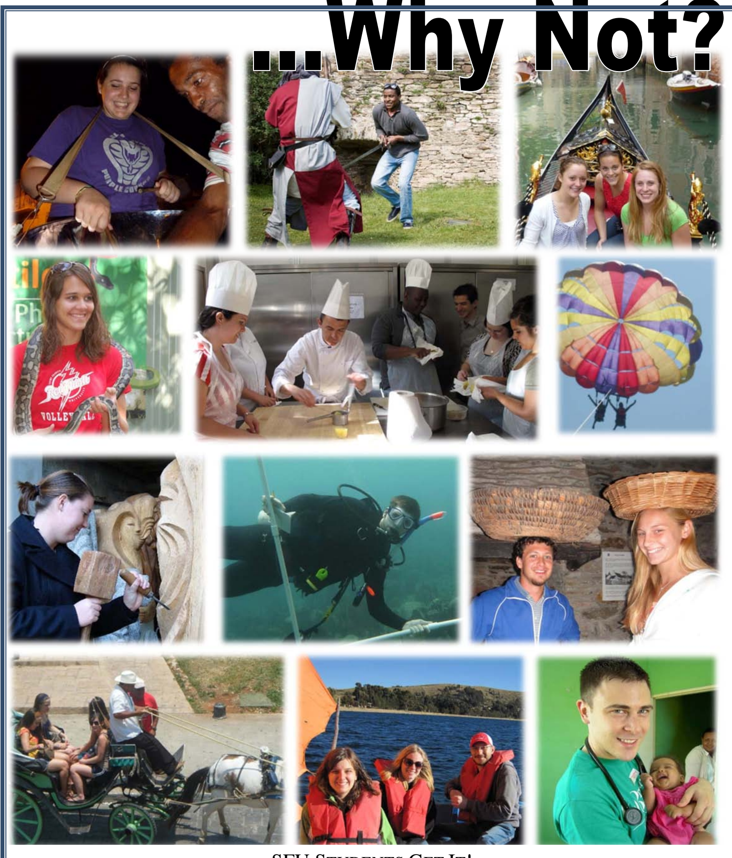
SFU STUDENTS GET IT!

According to the Institute of International Education's 2012 Opendoors findings, 1.4% of U.S. students in higher education have participated in study abroad. This past year, 8.4% SFU students have participated in study abroad.