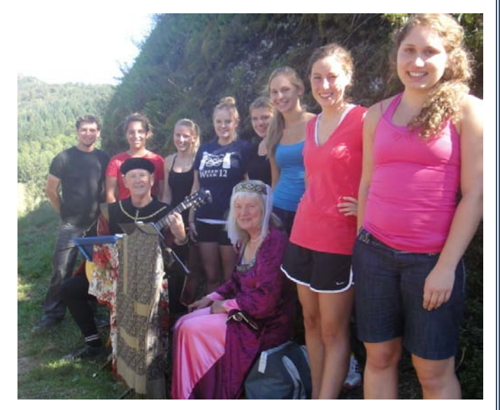
The 2012 fall Semester in France group celebrated a nationwide heritage day in Ambialet. Both as volunteers and participants, they joined in the festive occasion with guides dressed in medieval garb, musicians with lutes and recorders, and trails that explored the history of every nook and cranny on the mountain our students call home.

It was also good to return to SFU's home away from home in Ambialet. There is something so enchanting about our site