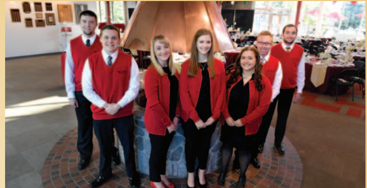
SFU's 2019 Founders Day hosts and hostesses.