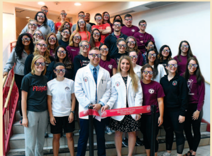
SFU students cut the ribbon at the 2019 Experiential Learning Commons Blessing and Dedication Day.

Numbers in ( ) indicate consecutive years of giving, based on the University fiscal year of July 1 to June 30.