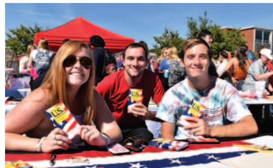
Constituent Day - Pre-law Club Members.

☉ Indicates member of the Saint Francis Society