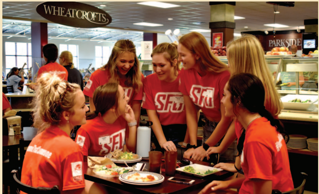
SFU students on Move In Day.