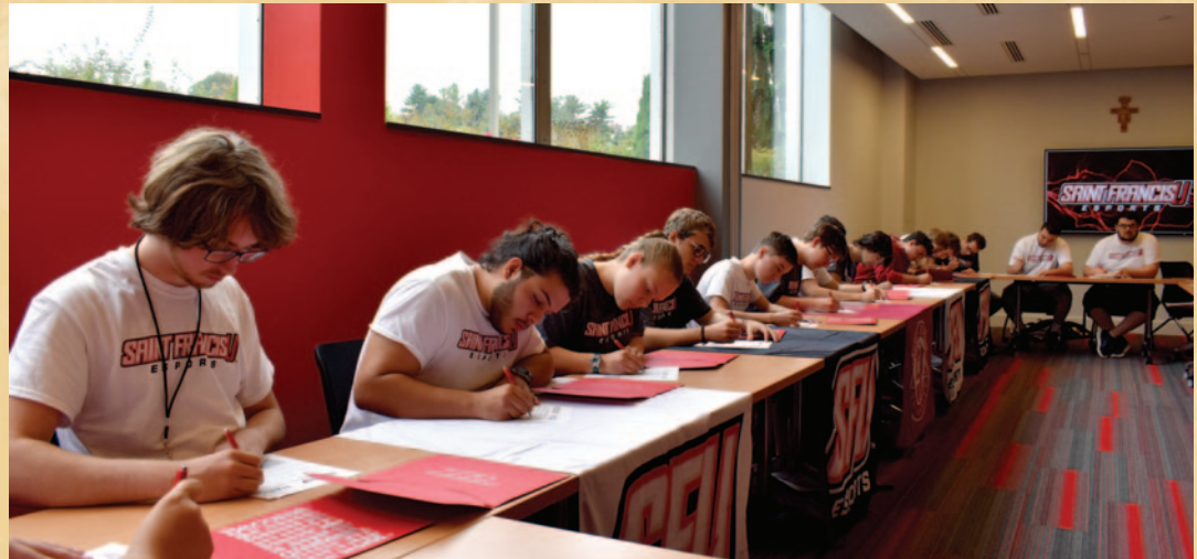
SFU's Esports Center.