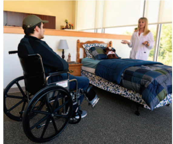
Students demonstrating skills in the Experiential Learning Commons.