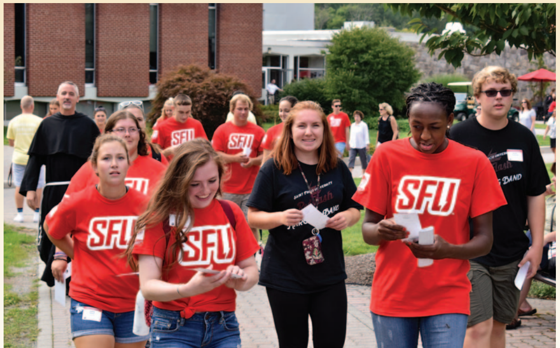
SFU students on Move In Day.