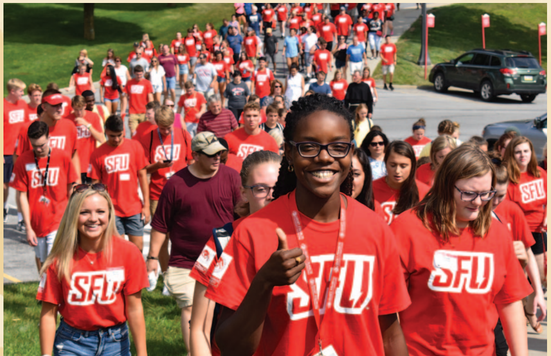
SFU students on Move In Day.