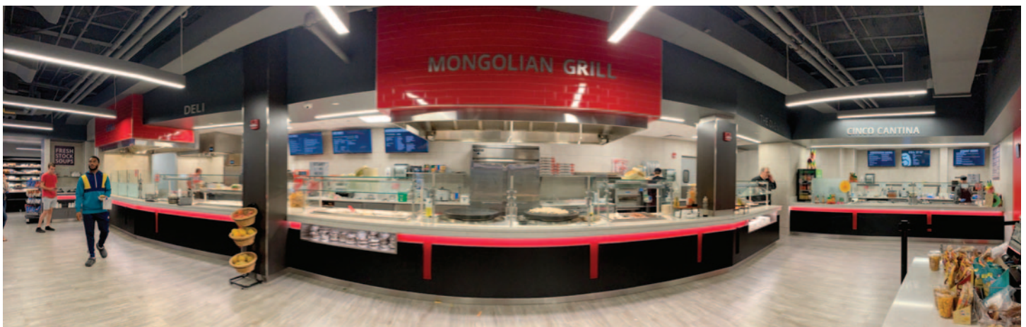
SFU's new Frankies

Numbers in ( ) indicate consecutive years of giving, based on the University fiscal year of July 1 to June 30.