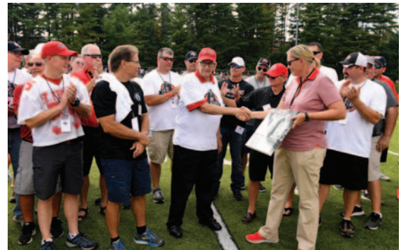
SFU's 50 th Football Celebration.