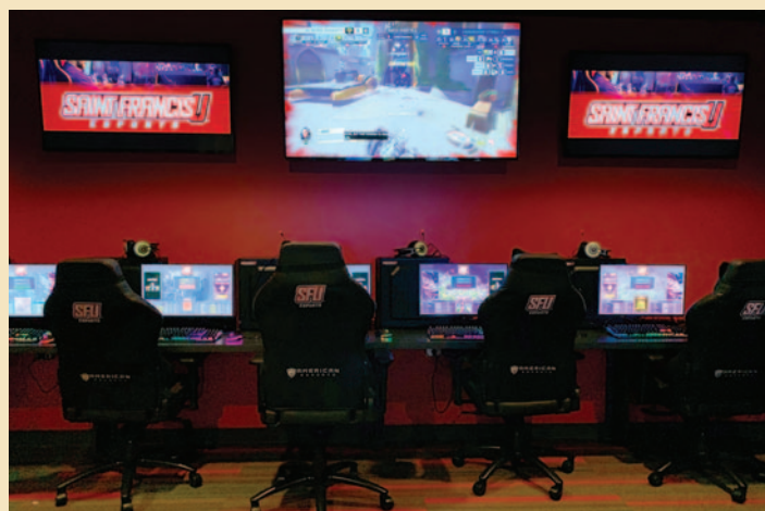
SFU's Esports Center.