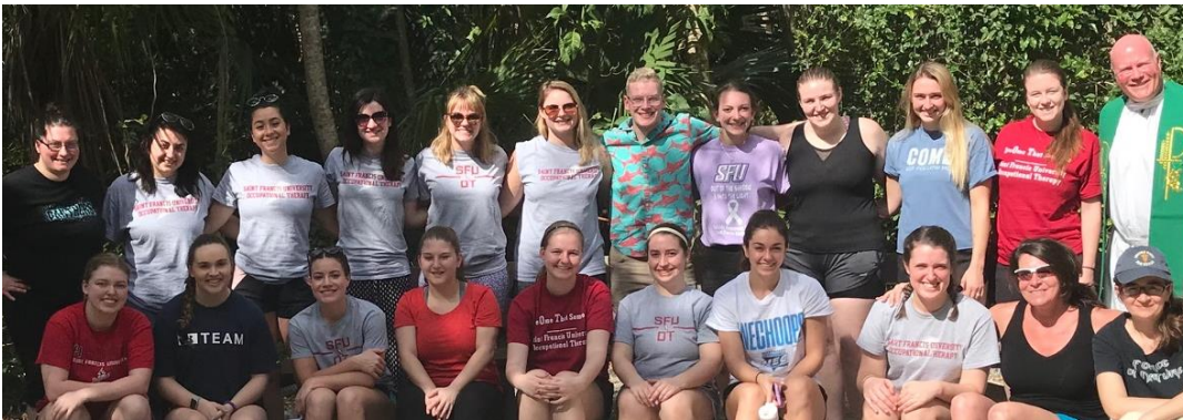
2019 HUGS Mission Group in The Bahamas

Twenty-three volunteers (2 administrators, 2 faculty members, 2 alumni and 17 students) traveled to The Bahamas to work with community partners, including the Adventure Learning Science Centre and Camp, the Stapledon School, the Bahamas Association for the Physically Disabled, and the Bahamas Children's Emergency Youth Hostel. Thirteen volunteers (1 faculty and 12 students) traveled to Anconcito, Ecuador, a little fishing village, to work with the Foundation for the International Medical Relief of Children. More than $4,000 in monetary donations were collected to buy supplies.