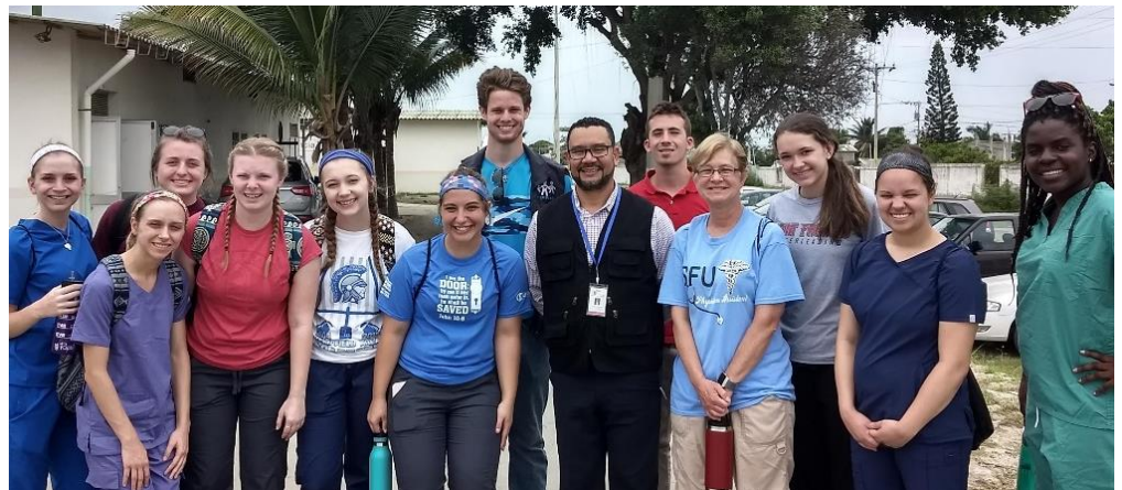
2019 HUGS Mission Group in Ecuador