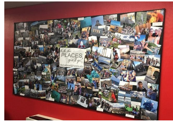
Check out the new study abroad photo display in the Library, "Oh the Places You'll Go."

SFU students recognize these benefits and lead the pack in study abroad. The Open Doors Report includes the national percentage of college students who study abroad before graduating is 10%. The percentage of SFU students who have studied abroad before graduating is 31.6%!