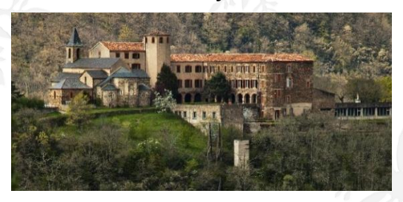
The University's site is a beautiful renovated historic priory, located in the picturesque Tarn Valley in southwest France. The building overlooks the quaint village of Ambialet. The centuries-old priory has been renovated with modern amenities. Ambialet is about 20 minutes from Albi (population 50,000), the largest city in the Tarn region of southwest France.