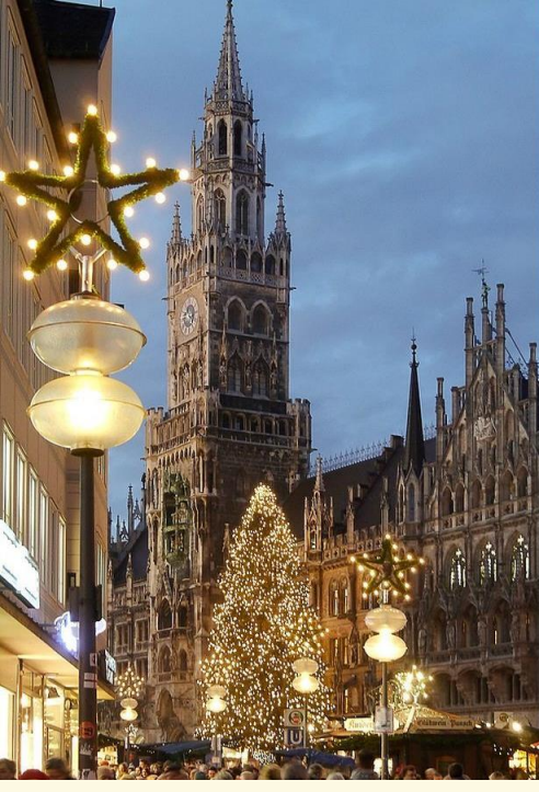
Christmas Market in Munich