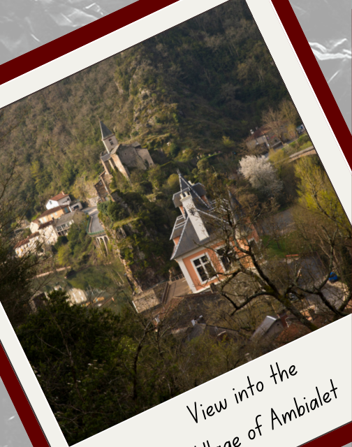
View into the Village of Ambialet