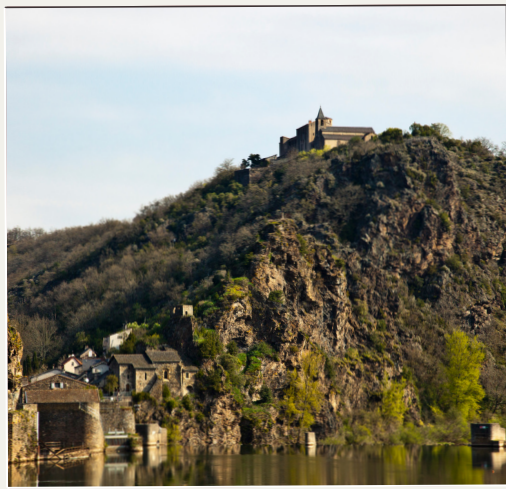
The villiage of Ambialet with Saint Francis University's site perched on the hilltop