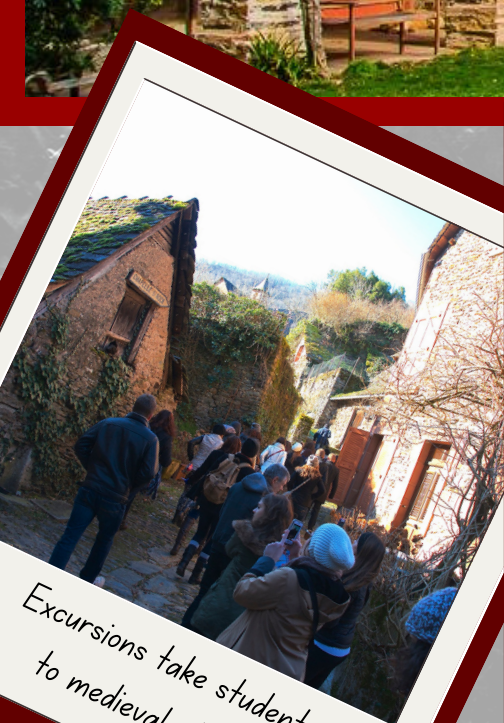
Excursions take students to medieval villages...