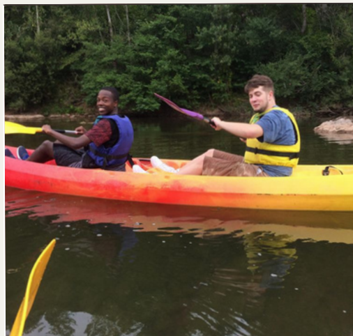
Activities, excursions, and hands-on learning in th ebeautiful surrounding region of Ambialet