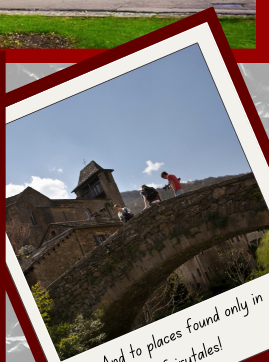
...And to places found only in fairytales!